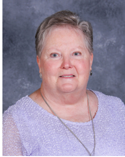
Area 4 Director