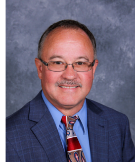
Area 10 Director