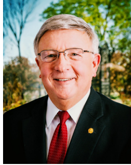
Area 6 Director