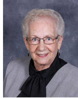
Area 8 Director