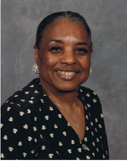
Area 2 Director