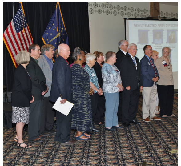
2022 Board of Directors swearing-in ceremony.